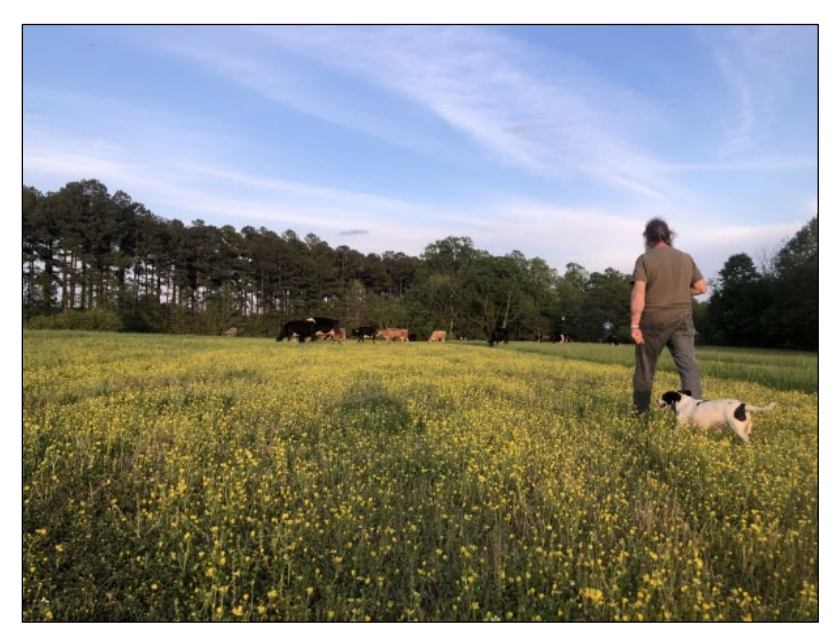
Figure 5. On Ran-Lew Dairy Farm

Once retail sales began to return to normal, Ran-Lew was again able to pivot its model to stay afloat in these economically difficult times. Sourcing local, seasonal ingredients, it was able to sell a wide variety