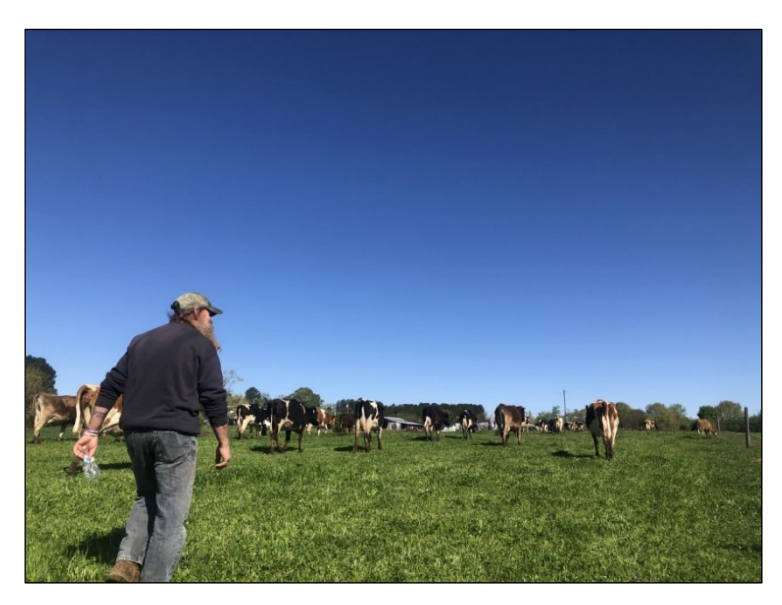
Figure 2. On Ran-Lew Dairy Farm

in Alamance County. Now, there are only four. The same trend is being seen across the country. The average herd size grew from 50 in 1987 to 175 in 2017 (MacDonald, Law, & Mosheim, 2020). Herds of 5,000, even up to 10,000, cows are becoming increasingly common (MacDonald et al., 2020). These trends in farm growth and consolidation are the result of a large push throughout the agricultural system, starting in the 1970s with then-Secretary of Agriculture Earl Butz's often quoted phrase to farmers, "get big or get out."