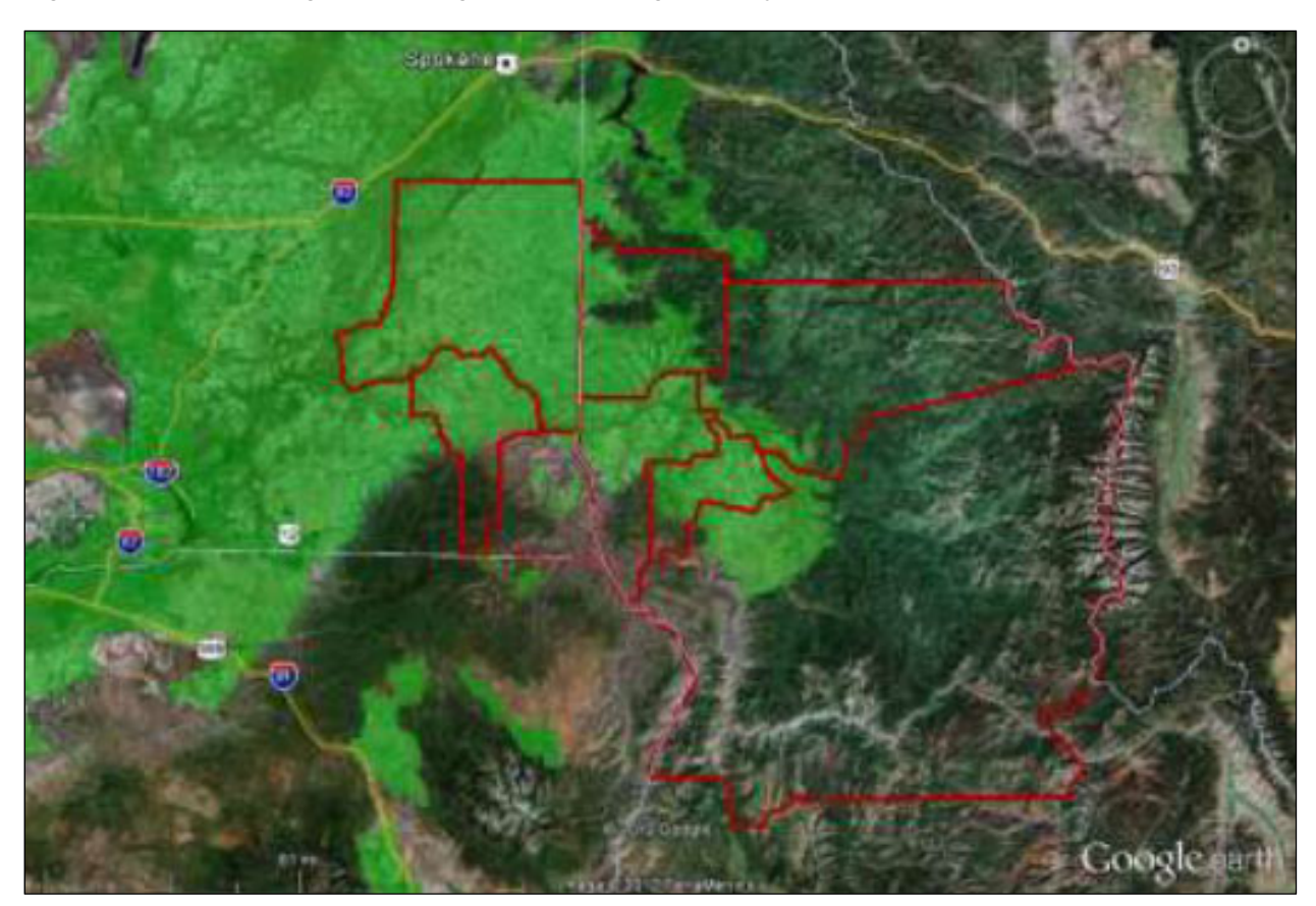
Figure 1. Level IV Ecoregions with Significant Growing Capacity

Primary data was collected through a producer survey that targeted food producers, processors, and other sellers, and through a purchaser survey that targeted large-volume buyers. These two surveys aimed to determine the market potential for a food innovation and resource center. The project followed the Toolkit's protocol to contact survey participants first via letters and emails. The letters and emails invited producers and purchasers to attend a regional food hub meeting and informed them they would be receiving an email