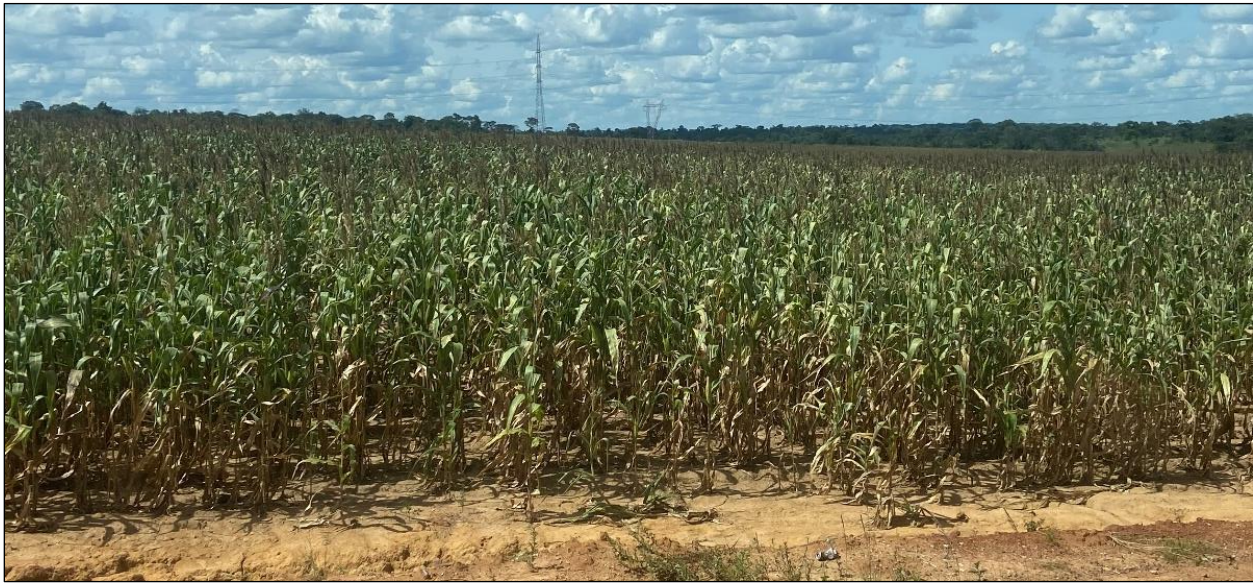
Figure 3. Maize Field Wilting along the Kasumbalesa Road in the Agricultural Region of Lubumbashi Following a Prolonged Dry Spell during the Growing Season